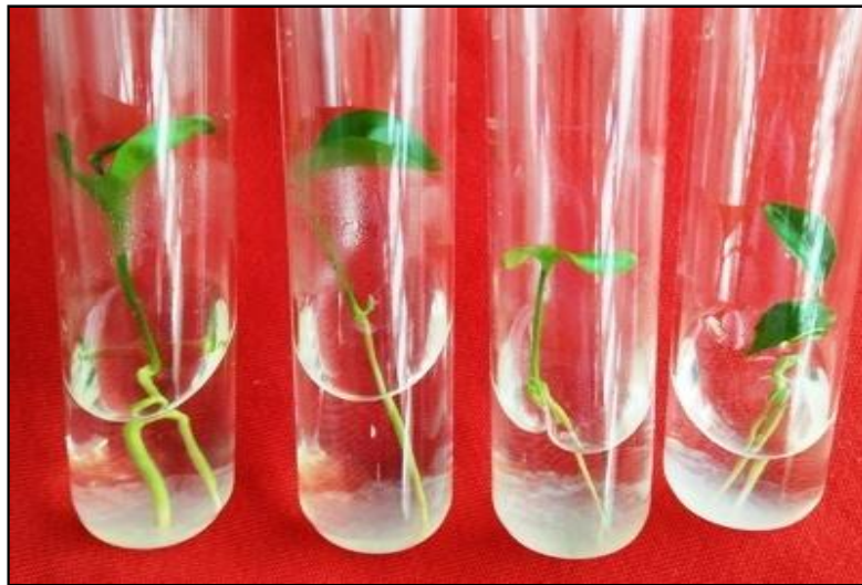
Fig. 5. Rooting response of shoots regenerated from mutagenic callus on MS medium supplemented without mutagen

* Values in parenthesis are Arc sine transformed values; ** MSA-half strength Murashige and Skoog medium supplemented with NAA (2 mg/l) without mutagen; a Rooting on Murashige and Skoog medium supplemented with NAA (2 mg/l)