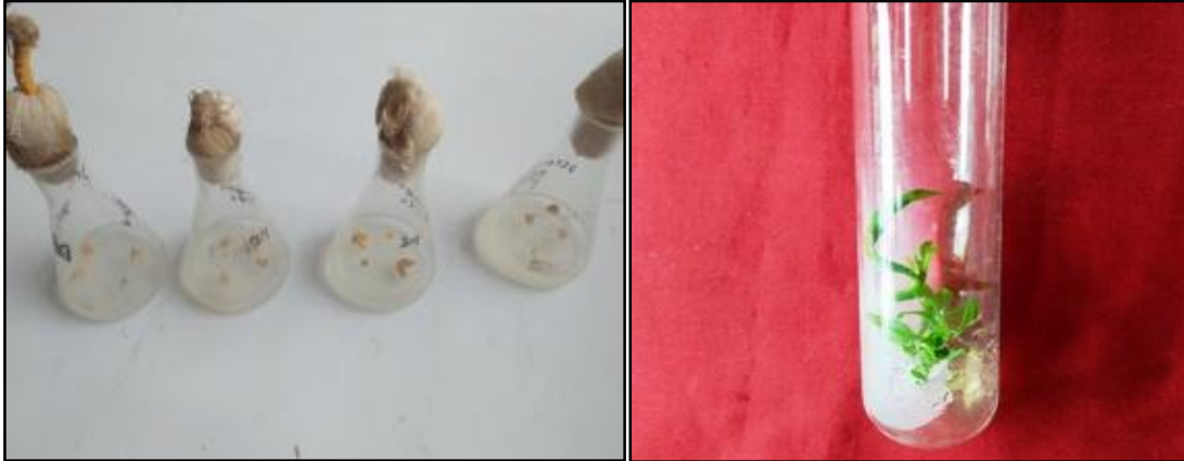
Fig. 7. 210 days old callus and its regeneration of 210 days old callus