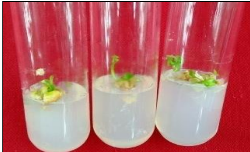
Fig. 3. Regeneration of mutagenic callus on MS medium supplemented with BAP (3.0 mg/l)