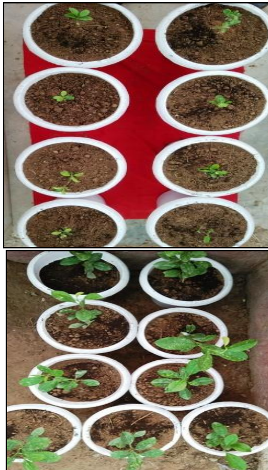
Fig. 6. Soma clonal plants transplanting in plastic pots

* Values in parenthesis are Arc sine transformed values; FYM: Farm Yard Manure