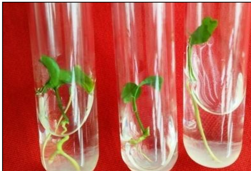
Fig 4. Rooting response of shoots regenerated from mutagenic callus on MS medium supplemented without mutagen

* Values in parenthesis are Arc sine transformed values; ** MSA-half strength Murashige and Skoog medium supplemented with NAA (2 mg/l) without mutagen; a Rooting on Murashige and Skoog medium supplemented with NAA (2 mg/l)