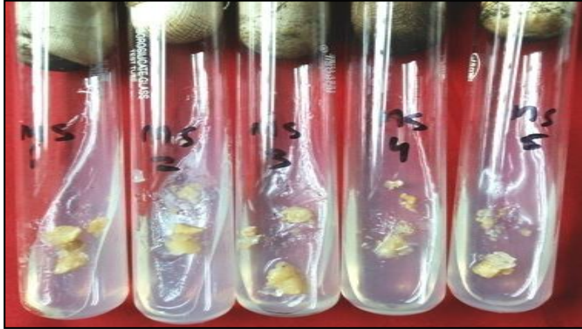
Fig. 2. Survival of calli on MS medium with 0.5 % EMS