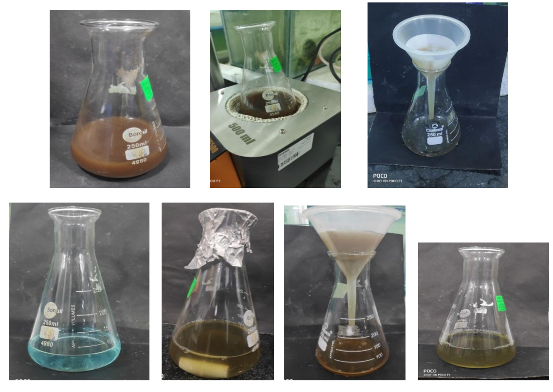
Fig. 1. The pictures show the preparation of musa sapientum plant extract and the sequence of colour changes