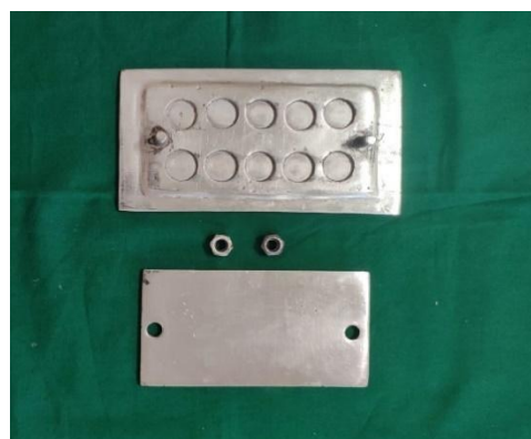
Fig. 1. Mold for testing abrasion resistance

A circular metal mould of size 15mm in diameter and 3mm in depth will be used. (Fig. no.:1). Chloramine-T will be weighed 50mg Chloramine-T per 100grams of type III gypsum product. For the control group type III gypsum product will be mixed with a bowl and spatula. For experimental group admix of type III gypsum product and 0.5% of chloramine-T will be mixed with bowl and spatula. The mix will be poured separately in the mold.