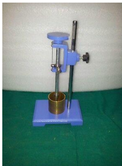
Fig. 2. Vicat needle apparatus

Cylindrical metal mould of vicat apparatus (Fig. 2) of dimensions 50 mm height and 35mm internal diameter will be filled with the mixture and smoothed with spatula. Mould is placed in the apparatus in its position. Prior to setting of the gypsum product valve screw will be loosened to allow the needle tip to just touch the surface of the gypsum product. Then needle will be released to penetrate the mix, needle should reach up to the bottom of the mould. This entire process is to be repeated every 30 seconds, each time mould is slightly repositioned and needle is to be cleaned. Every time valved screw is tightened when needle will be penetrate the mix and degree shown in the stylus is to be recorded. This process is repeated until needle cannot penetrate up to the bottom of the mould.