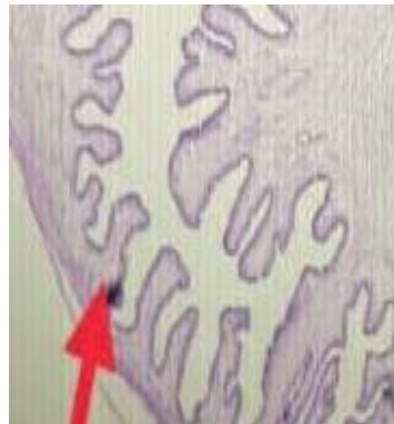
Fig. 4. 40X: Shows the double layered, Duct like invaginations, eosinophilic membrane seen on histopathology

Cysticercosis was diagnosed on the given tissue biopsy from the concerned site. After which the patient was managed surgically by enucleating the cysticercus lesion in the cheek, along with antihelminthic medications (albendazole), so as to treat the disease systemically.