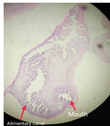
Fig. 2. Scanner: Shows mouth and alimentary canal of the Cysticercus parasite seen on histopathology