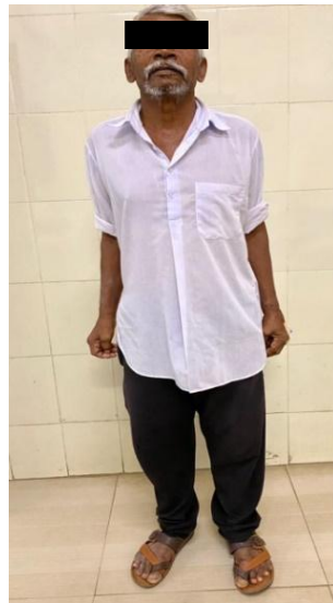
Fig. 1. POSTURE: Standing