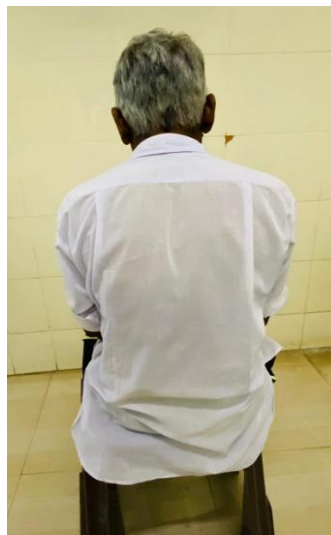
Fig. 2. POSTURE: Sitting