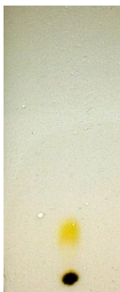
Fig. 2. TLC plate developed with Toluene : Acetic acid (4:1)