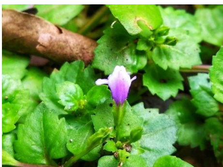
Fig. 1. Lindernia crustacea (L) F.Muell

Nutrient agar medium (Himedia, India), Potato dextrose medium, Sabouraud Dextrose Agar medium (Himedia, India) and Whatman No. 1 filter paper were used during the experimental protocol.