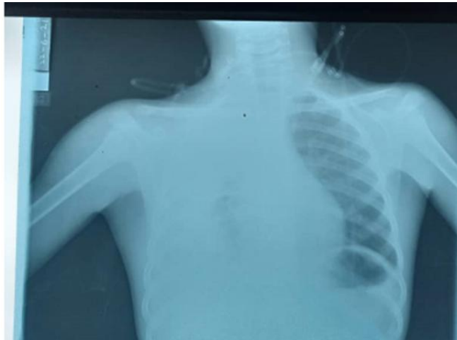
Fig. 1. CXR showing massive right pleural effusion