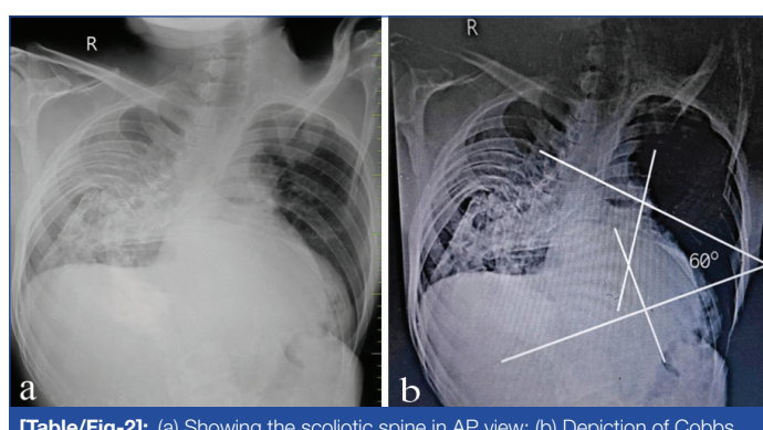
[Table/Fig-2]: (a) Showing the scoliotic spine in AP view; (b) Depiction of Cobbs angle in AP view, as shown here when two parallel lines are drawn from the first scoliotic vertebrae and the last scoliotic vertebrae and the angle of their intersection using Picture Archiving and Communication System (PACS).

[1] was discovered during the preanaesthetic airway examination, showing acceptable mouth opening and neck mobility. Severe scoliosis was observed on inspection at the levels of the thoracic and lumbar spines. When the lumbar spine was palpated, the interspinous space was not felt. A right-sided scoliosis with a 60° Cobb angle [2], as determined by the intersection point of two parallel lines, was observed on the X-ray of the whole spine, specifically the thoracolumbar region [Table/Fig-2a,b].