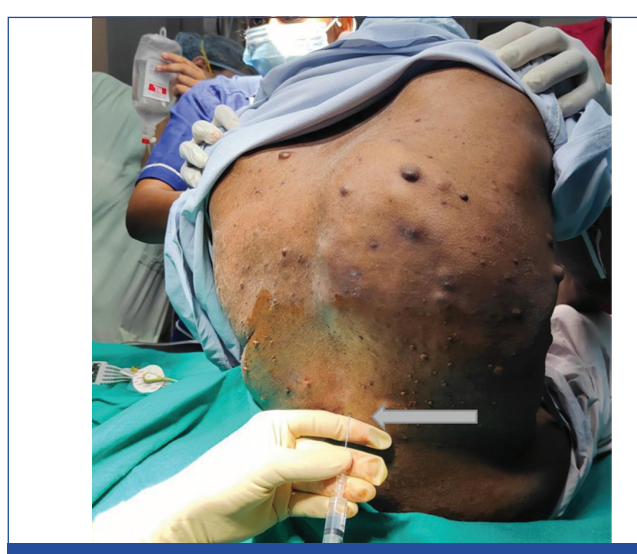
[Table/Fig-4]: Intraoperative figure showing severe scoliosis on the right-side (arrow indicating point of insertion of the quincke spinal needle for subarachnoid block).

The L2-L3 intervertebral space was punctured with a 23-gauge Quincke spinal needle using a modified paramedian approach [3] while the patient was sitting and under stringent aseptic circumstances. Just a brief penetration perpendicular to the skin, lateral to the dorsal spine, is intended for the needle [Table/Fig-4].