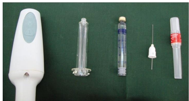
Figure 3. Parts of Comfort Control Syringe Handpiece.