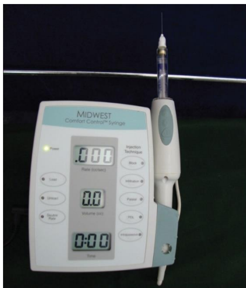
Figure 2. Comfort Control Syringe.

Clinical evaluations were carried out in each eligible patient before commencement to evaluate whether sensitivity was already present. Patients who were suffering from sensitivity prior to cavity preparation were not included in the study. Patient who reported sensitivity during cavity preparation underwent sensitivity testing procedures. Sensitivity was evaluated using a calibrated pulp tester by a trained examiner who was blinded to the study groups. The subjects were then injected with 2% lignocaine with 1:80,000 adrenaline, using the allotted injection technique; 0.2