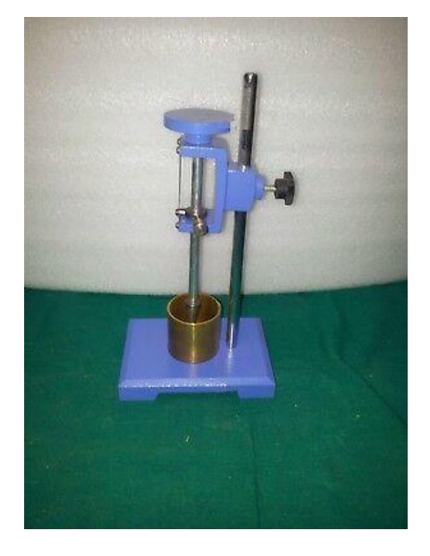
Fig. 2. Vicat needle apparatus

Cylindrical metal mould of vicat apparatus (Fig. 2) of dimensions 50 mm height and 35mm internal diameter will be filled with the mixture and smoothened with spatula. Mould is placed in the apparatus in its position. Prior to setting of the gypsum product valve screw will be loosened to allow the needle tip to just touch the surface of the gypsum product. Then needle will be released to penetrate the mix, needle should reach up to the bottom of the mould. This entire process is to be repeated every 30 seconds, each time mould is slightly repositioned and needle is to be cleaned. Every time valved screw is tightened when needle will be penetrate the mix and degree shown in the stylus is to be recorded. This process is repeated until needle cannot penetrate up to the bottom of the mould.