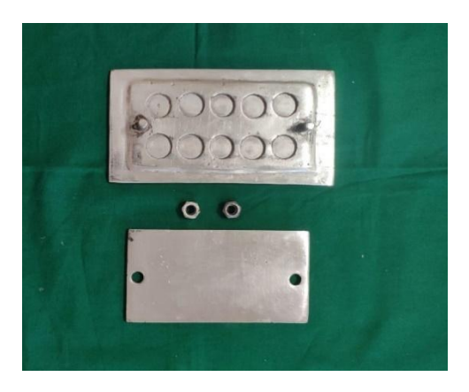
Fig. 1. Mold for testing abrasion resistance

A circular metal mould of size 15mm in diameter and 3mm in depth will be used. (Fig. no.:1). Chloramine-T will be weighed 50mg Chloramine-T per 100grams of type III gypsum product. For the control group type III gypsum product will be mixed with a bowl and spatula. For experimental group admix of type III gypsum product and 0.5% of chloramine-T will be mixed with bowl and spatula. The mix will be poured separately in the mold.