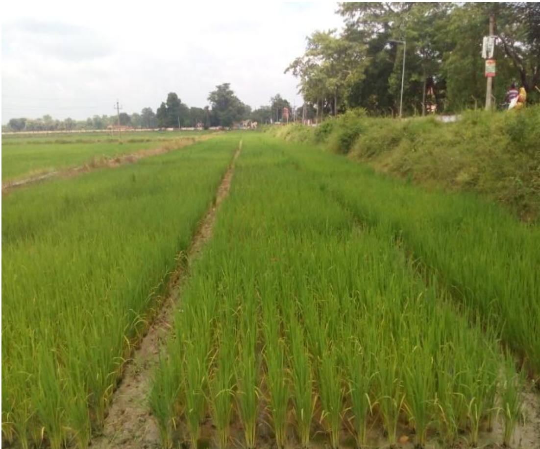
Fig. 2. Pre-flowering stage of rice genotypes