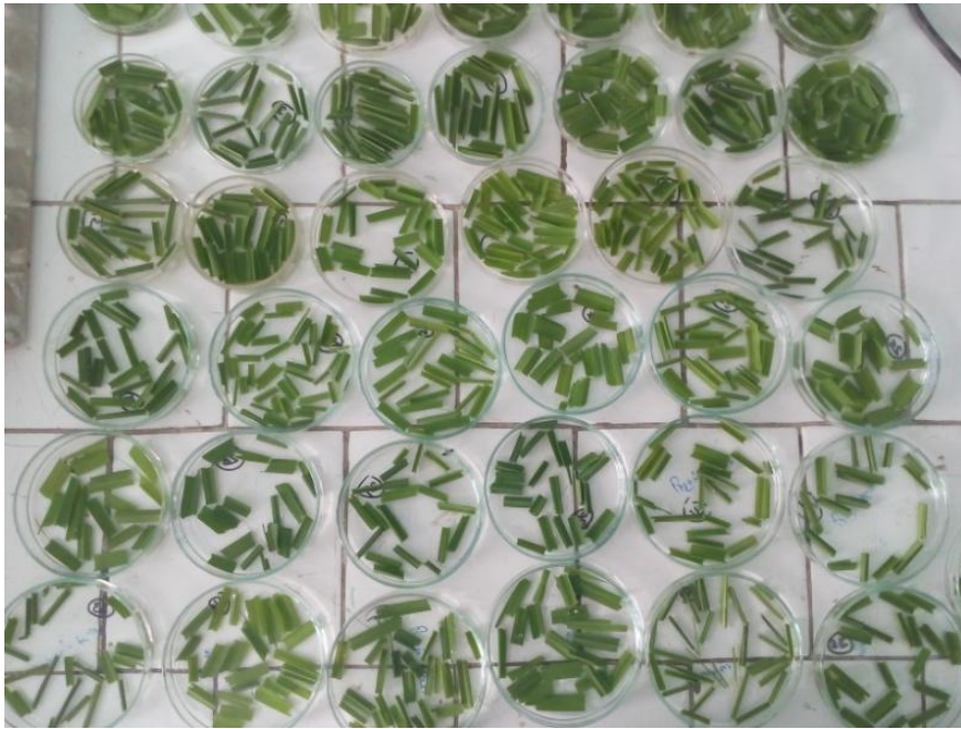
Fig. 1. Relative water content measurement