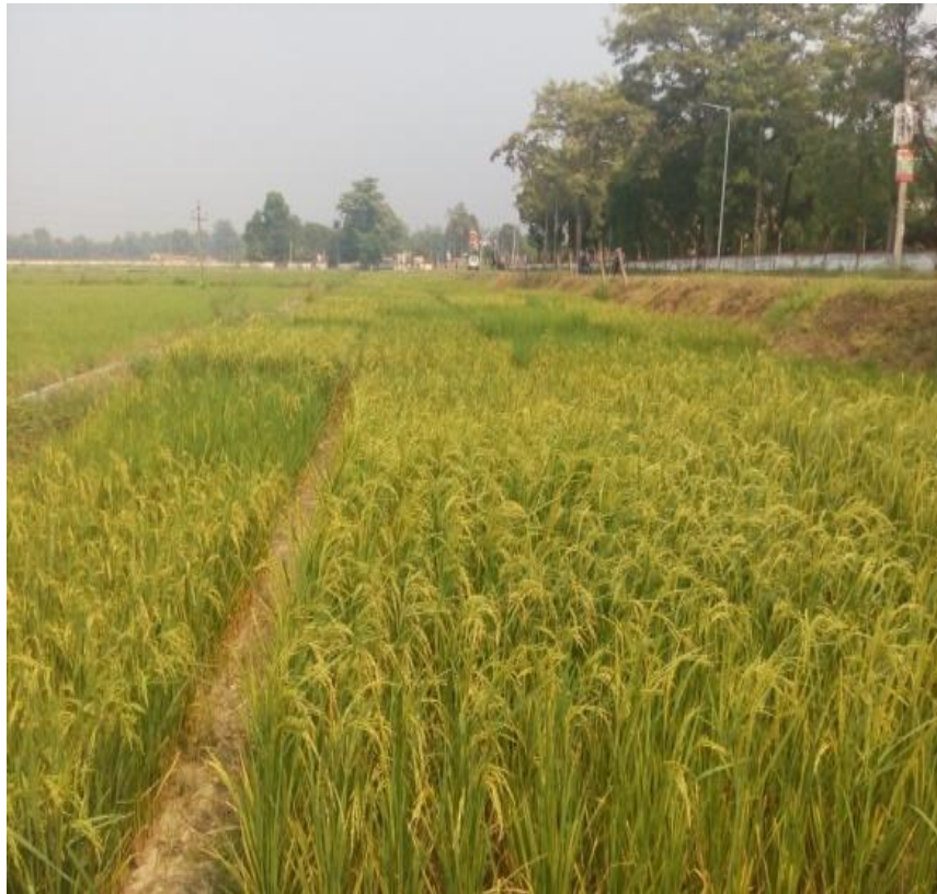
Fig. 3. Grain filling stage or rice genotypes