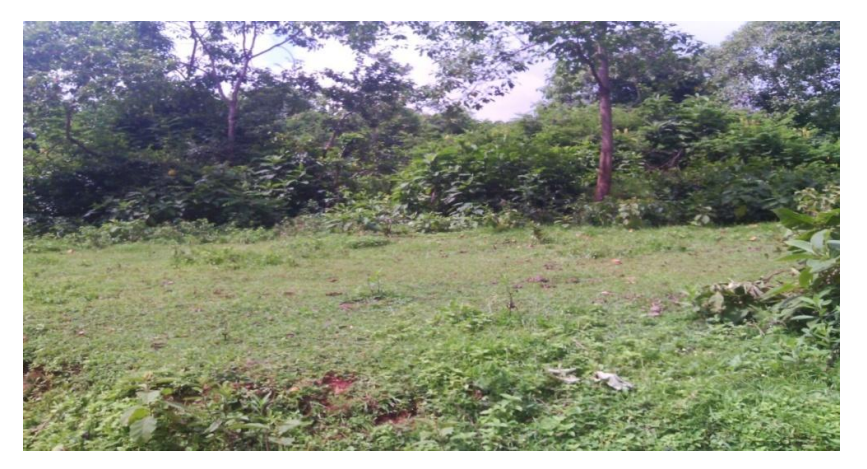
Fig. 3. Land where quarrying has not taken place