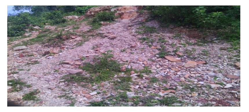
Fig. 2. Loss of vegetation cover

The mean of the socioeconomic wellbeing of the community was 6.43 (Medium level) and ranged from 0.38 (extremely low) to 9.53 (Very high). This results show that most households had a medium level of wellbeing, hence the community is positively benefiting from soapstone quarrying activities.