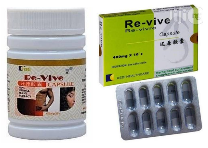
Fig. 1. Revive capsule

Phosphodiesterase type-5 inhibitors exert their pharmacological effects by selectively inhibiting an enzyme called phosphodiesterase type-5 (PDE-5) (Huang and Lie, 2013). The process of attaining an erection entails coordination between pathways such as the psychological, neurological, and vascular pathways; these pathways unite to process a physiologic